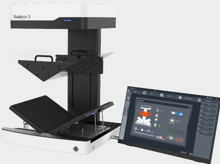
The Bookeye® 5 V3A Automatic with V-shaped book cradle and glass plate.

The V-shaped glass plate is controlled via the ScanWizard's extended user interface. The new control panel with animated function buttons allows, among other things, horizontal movement up and down, setting the speed or the position in which the glass plate remains after the finished scan job. It does not necessarily have to be at the top or bottom. Depending on requirements, the glass plate can be removed and refitted without tools and in two simple steps.