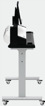
Required depth less than 25", 65cm