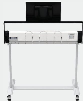
PC built in, no extra hardware in the back