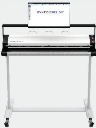
Very compact design

The WideTEK36CL-600-MF3 solution is by far the fastest color CIS scanner on the market, running at 10 inches per second at 200 dpi in full color. At the full width of 36" and at 600 dpi resolution, the scanner still runs at 1.7 inches per second. The scanning speeds are tripled in black and white and greyscale modes but can be individually configured if required; for example, to scan fragile or valuable documents.