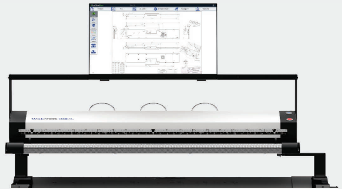
Scanner mounted on Canon printer